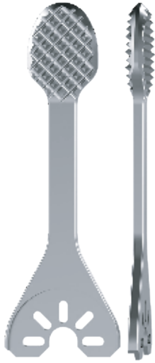
Flat Single/Double Sided