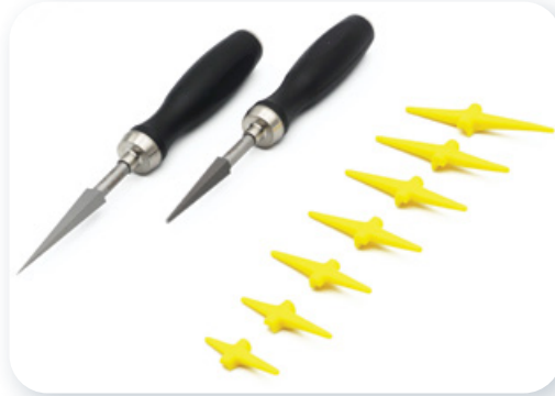
SILASTIC MCP/PIP REPLACEMENT

Distributed by Lavender Medical, these are ALSO AVAILABLE IN THE UK