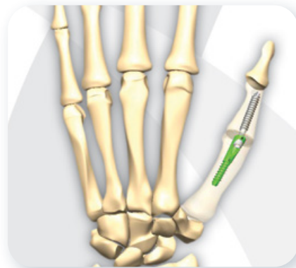
XMCP™: INTRAMEDULLARY FUSION DEVICE