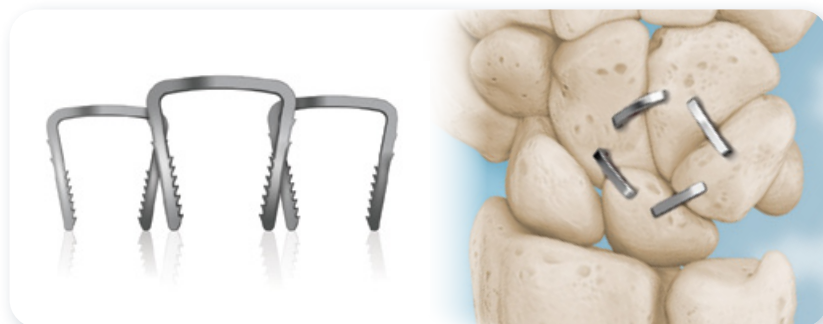
NEOSPAN STAPLES INDICATED FOR THE HAND